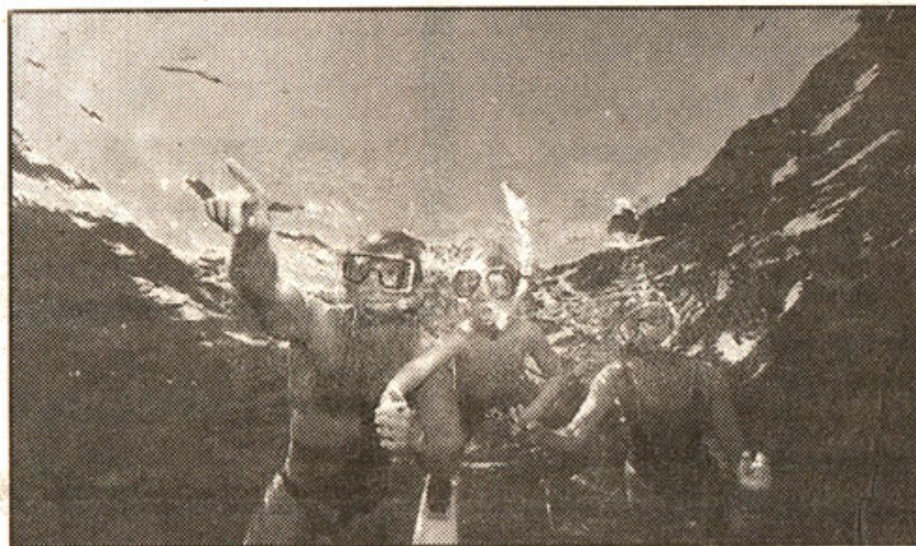
THE FAMILY THAT snorkels together, stays together.

With water visibility ranging from 75 to 150 feet (25-43 metres), and 35 distinct dive sites five to 30 minutes away, the possibilities underwater are unlimited. AKR is suited to the eco-traveller and ideal for families, offering children and adults the opportunity to